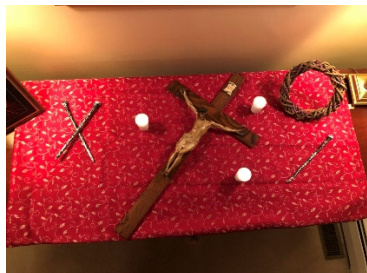
Table 2—Good Friday

Tonight we remember the Eucharist instituted by Jesus during the Last Supper. Also tonight Jesus teaches disciples the value of service and a new commandment of love as exemplified by washing the disciples' feet. As a family, discuss the gift of the Eucharist. The pitcher and basin remind us of the invitation Jesus extends to disciples to serve others after He washes their feet. Reflect together on ways others have served you, or ways in which you have served others.