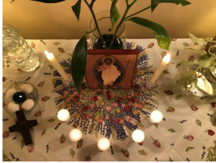
Table 3—Easter Vigil (Holy Saturday)

If you've ever gone to church on Good Friday, you likely experienced the Stations of the Cross or heard the last seven words of Jesus. At another liturgy you might have witnessed the reading of the Passion, adoration of the Cross and/or extremely long petitions. Some liturgies administer Holy Communion, reserved from the liturgy of Maundy Thursday. This day reflects on the sacrifice Jesus made on the cross. The day is about emptying, perhaps refraining from television, social media or other unnecessary activities from noon to 3 p.m. Try to go out of your way to add some extra time of prayer on this day.