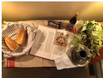
Table 1—Maundy Thursday

The Paschal Triduum is a journey with Jesus from death to new life. Due to the pandemic this year we might have to change how we celebrate these important feasts. This inconvenience need not prevent us from remembering and celebrating what the liturgies of Holy Week commemorate. Creating the three following, changeable tables each of these Triduum days is a way for families to prepare their homes for the celebration of Holy Week: